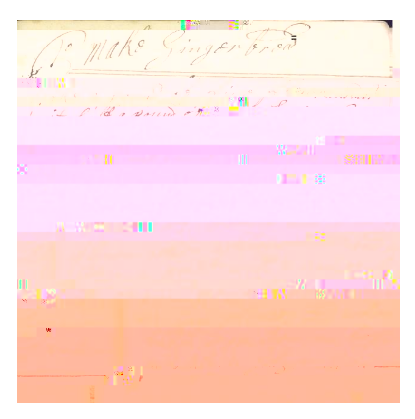
NCA 962 f. 27r